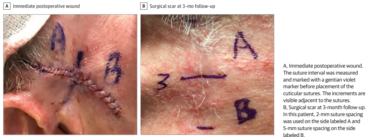
Figure 2. Postoperative Wound and Surgical Scar

were the same. All results achieving a 2-tailed P < .05 were considered to be statistically significant. All analyses were performed with Stata/MP 13 (StataCorp).