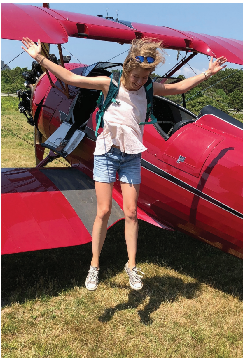
Fig 2 | Representative study participant jumping from aircraft with an empty backpack. This individual did not incur death or major injury upon impact with the ground

The PARACHUTE trial satirically highlights some of the limitations of randomized controlled trials. Nevertheless, we believe that such trials remain the gold standard for the evaluation of most new treatments. The PARACHUTE trial does suggest, however, that their accurate interpretation requires more than a cursory reading of the abstract. Rather, interpretation requires a complete and critical appraisal of the study. In addition, our study highlights that studies evaluating devices that are already entrenched in clinical practice face the particularly difficult task of ensuring that