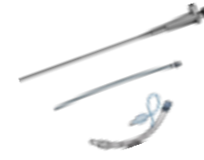
FIBEROPTIC STYLET OR FLEXIBLE FIBEROPTIC SCOPE

FIBEROPTIC INTUBATION THROUGH iLMA MALLEABLE FIBEROPTIC STYLET (eg : Levitan ) FIBEROPTIC SCOPE (eg : Ambu Ascope 2 )