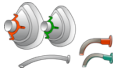
MASK, NPO, GUEDEL

FACE MASK NASOPHARYNGEAL AIRWAY GUEDEL AIRWAY CLASSIC LMA (cLMA) INTUBATING LMA (iLMA) eg : Fast Trach or AirQ