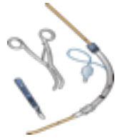
SCALPEL BOUGIE - ETT